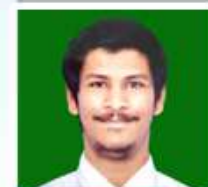
VEERAJA V 96 %